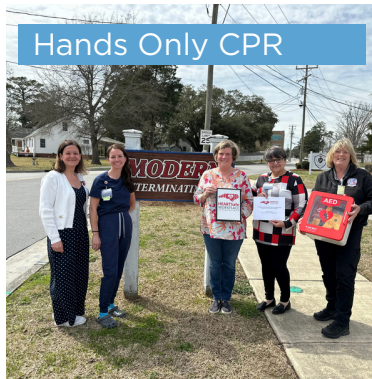
Hands Only CPR

Hands-Only CPR is a proven, lifesaving technique that is as effective as conventional CPR for cardiac arrest in teens and adults when performed within the first few minutes. At Onslow Memorial Hospital, our dedicated team regularly delivers this vital training at community events and for small groups, empowering community members to act confidently in emergencies. In fiscal year 2025 alone, our teammates trained 656 people in Hands-Only CPR, and we are committed to continuing these educational efforts. To learn more or to schedule a training for your organization, please get in touch with Nancy Pate at Nancy.Pate@onslow.org .