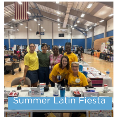
Summer Latin Fiesta

The Onslow Hispanic Latino Association hosts an Annual Summer Fiesta that honors the Hispanic and Latino culture with traditional music, authentic cuisine, and family-friendly activities. The event attracts hundreds of attendees, and last year marked the first time Onslow Memorial Hospital participated as a sponsor and community partner, providing Stroke Screenings and educational materials in both English and Spanish for participants. OMH screened 58 people at this event.