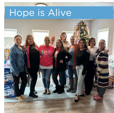
Hope is Alive

Hope is Alive offers a network of sober living homes in Onslow and surrounding counties, including a nearby residence in Hubert, NC, that supports 12 women on their recovery journey. In the last fiscal year, teammates at Onslow Memorial Hospital extended meaningful support to these women by providing holiday gifts, fostering a sense of community and encouragement during a pivotal time in their lives. This partnership reflects our commitment to uplifting individuals in recovery and promoting hope, healing, and resilience within our community.